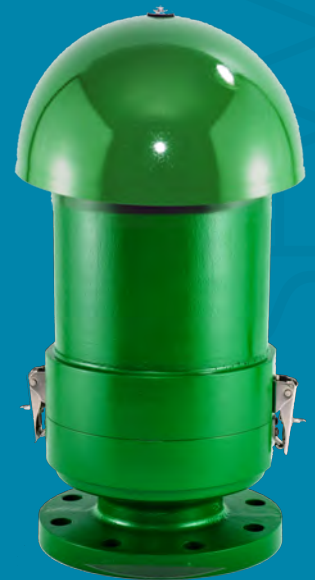
Vertically mounted 1800 with rainshield.

A vertically mounted 1800, with rainshield is also available to protect the media from water damage in any rain event.