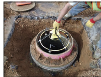
Remove catcher assembly

Save time and MONEY , plus eliminate the need for confined space entry.