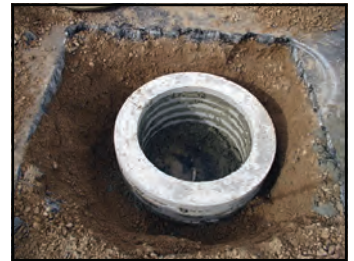
Build up using manhole adjusting rings