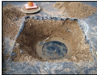
Insert catcher assembly and rubber stopper