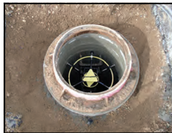
Clean off and remove rubber stopper