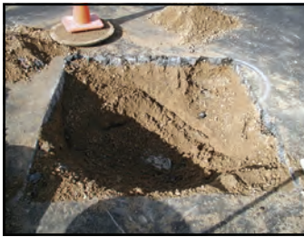
Expose the manhole