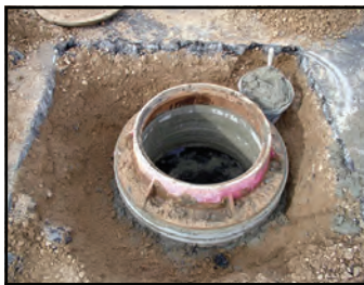
Install manhole casting